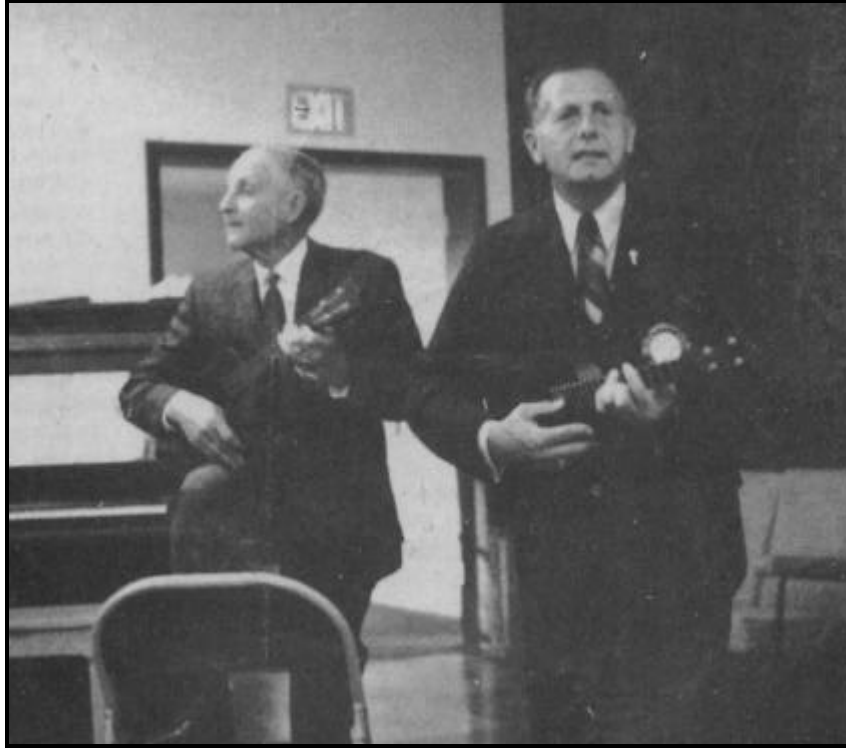
1968: The “Limestone Boys” at the Waverly Lions Club 25 th year celebration. [Waverly paper]