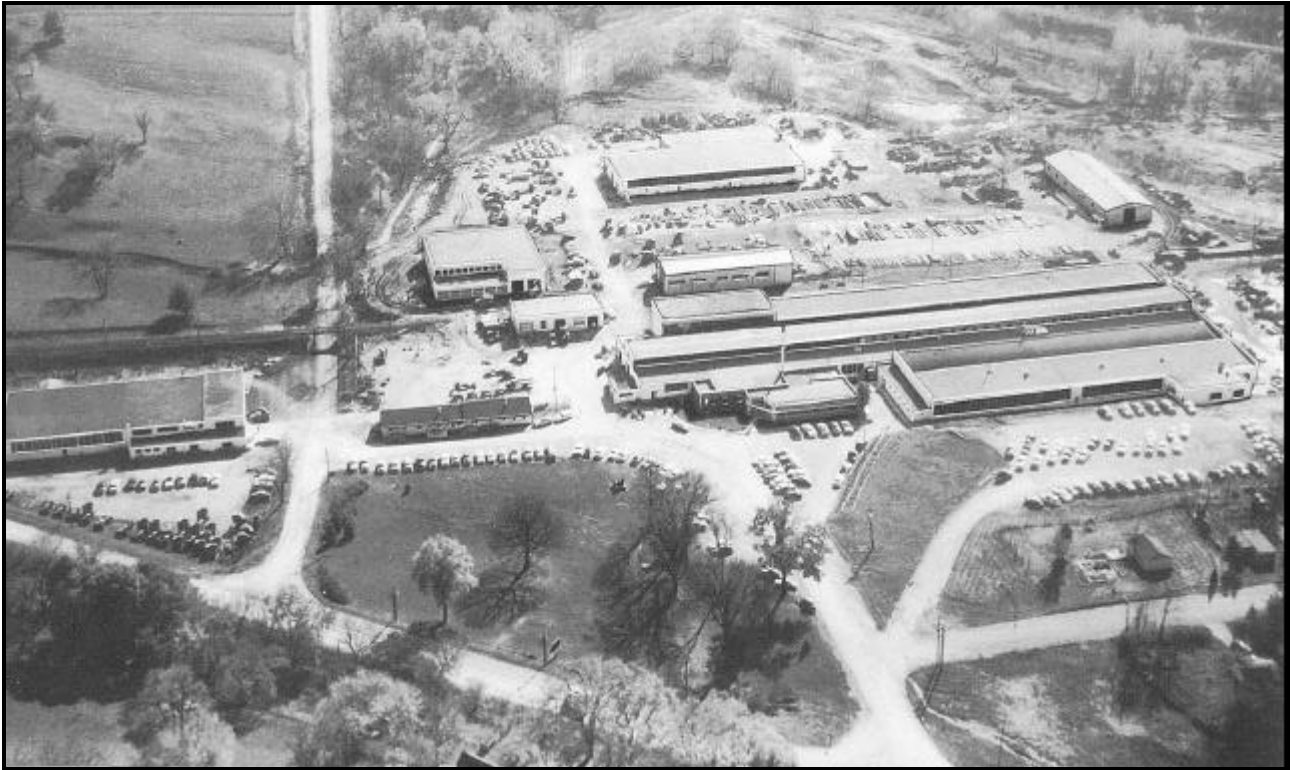
Schild Bantam Company in Waverly, Iowa. Moved into first building on June 26, 1946.