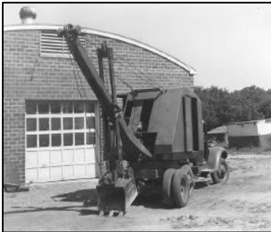
Bantam shovel outside plant at Quarry