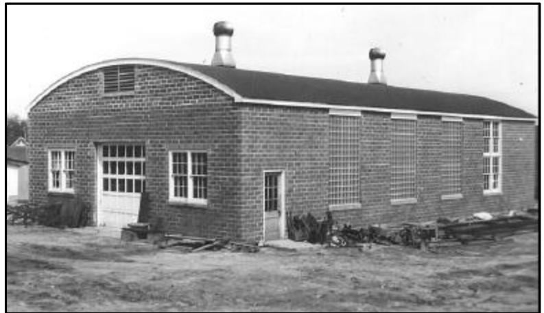
New plant at Quarry