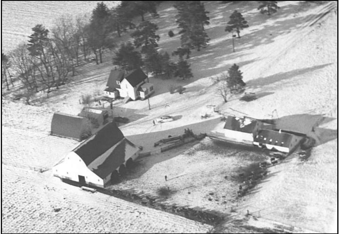
Ray's farm north of Waverly off Highway 218. Picture taken December 19, 1954 at 2:30 PM.